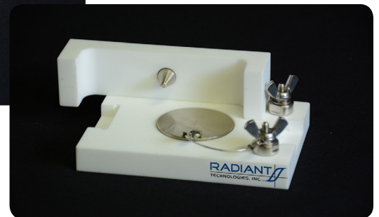
Alumina Cables Connected to High Temperature Test Fixture

If you require longer cables, please specify in your purchase order or contact Radiant Technologies for us to make a custom pair.