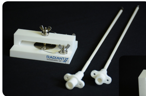
The High Temperature Alumina Clad High Voltage Cables

NOTE: The cables may not prevent leakage that might occur through the ambient atmosphere of the furnace at the elevated temperatures of the test. If you experience significant leakage during tests, make the same measurements with an unmetallized sapphire or quartz plate in the test fixture to determine if there is a parasitic conduction path. With no sample in the test fixture, make sure that the top and bottom electrodes of the test fixture are not in contact during the test.