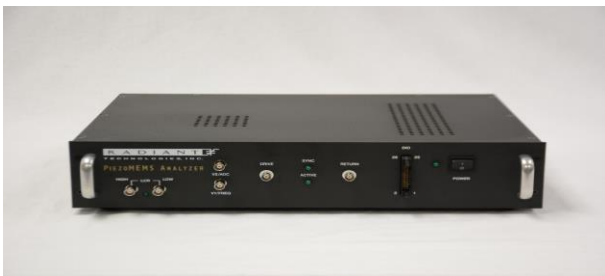
New PiezoMEMS Analyzer